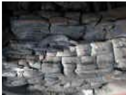
Here is a close up of the wood in the front part of the barrel.