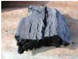
Here is a close up of an individual piece. it is charred all the way through.