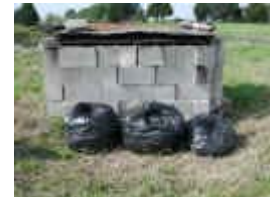
Here is the yield. Two and a half 32 gallon trash bags Making charcoal can be time consuming but it is not hard and it is fun. There is something satisfying about loading scrap wood in a barrel, applying fire then removing a different substance from the barrel. Makes you feel like the alchemist of old.