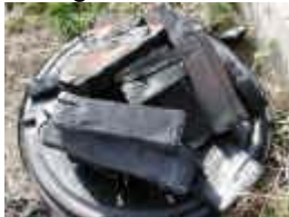
Here This is all the wood that did not char all the way through. This is fairly typical amount for a burn.